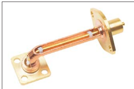
Figure 2 · The PTFE beads used to separate the center conductor from the outer shield are clearly visible in this cutaway photo.

The evolution of the electroform process technology at Semflex began with a prime contractor requirement for a missile system employing RF systems operating in the high microwave frequencies. Since the outer enclosure of a missile is round, it conflicts with the generally square electronic subassemblies contained within it. In addition, there is limited area in which to work, so connections between modules require an interconnect system that can accommodate severely tight bends without compromising either performance or reliability. The customer had tried implementing flexible cable, but insertion loss was too high compounded with concerns that the connector would not fit with the space constraints. Semi-rigid cable was considered next, but the requisite bends were too sharp and susceptible to breakage. In addition, performance was compromised because a discontinuity was created at the point of the bend, where the distance between center conductor and shield narrowed. An electroformed approach was proposed by Semflex as a possible solution.