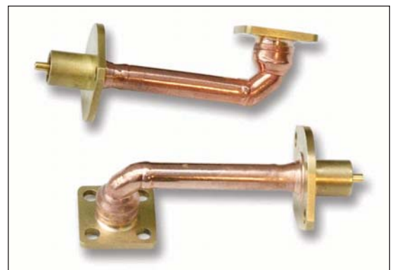
Figure 1 · Typical electroformed interconnect systems by Semflex.

Traditional microwave interconnection systems have evolved from waveguide, to semi-rigid cables and formable cables, to flexible cables. Waveguide has distinct advantages in terms of insertion loss and power handling capabilities, but at low microwave frequencies they are unwieldy. Except in cases where high power levels must be handled, other alternatives are generally preferred. In most instances, the first choice of designers is semi-rigid cable for its low cost, connector choices, formability to a traverse circuitous path, and relative small size and ruggedness.